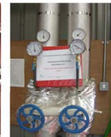
BIOMASS BOILER HOUSE Photographs | Left to right Boiler House, adjacent to housing scheme, but accessed via Dalflour Industrial Estate. Back up oil tank, feeding oil fired boiler, in view | External storage yard, with wetter wood chip for large boiler. All material delivered to site by a transporter, then moved around site by a Manitou | Dry wood store feeding boiler by walking floor action | Large 400 kW Kohlbach boiler for winter use, over 7 to 8 months of the year | Smaller 120kW Thermia boiler for use over summer months, approximately 4 to 5 months of the year. In addition an oil fired boiler serves as a backup to both | Two accumulator tanks storing hot water for distribution through district heating scheme | Temperature gauges to heating system, measuring output and return temperatures

130 homes heated by district heating with woodchip boilers Includes 30 existing homes previously heated by oil 3 boilers (2 woodchip @ 400KW and 120KW respectively, 1 oil backup @ 540KW) 3km of distribution pipework Total cost £1million Woodchip sourced locally Metered system with heat paid in advance at Council office Albyn owned and controlled with heat contract negotiated with Buccleuch Bio-energy Ltd