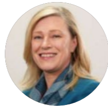
Gillian Martin MSP Minister for Energy The Scottish Government