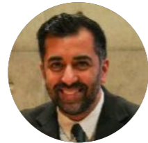
Rt Hon Humza Yousaf MSP First Minister of Scotland